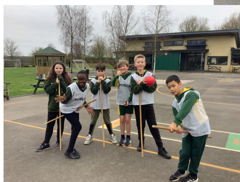
Oak loved Quidditch