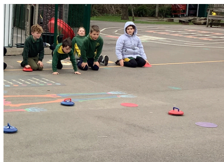
Beech tried Curling