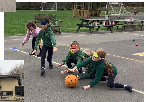
Sycamore play goal ball